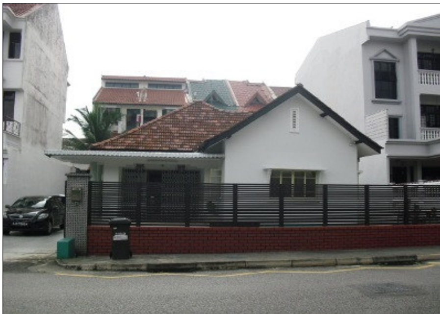
254 Onan Road

For further information for upcoming auction, please refer to the following pages