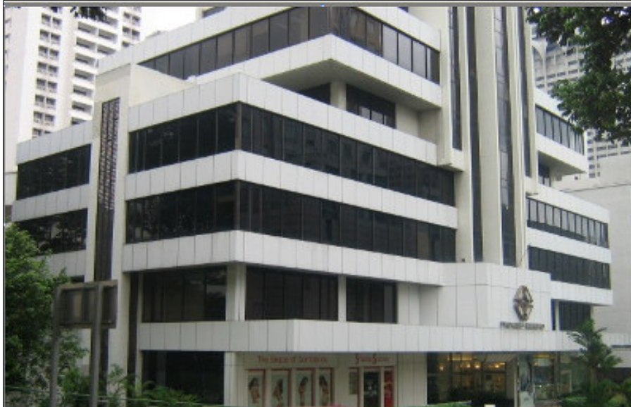
Thong Sia Building (Level 1 to part of Level 7) Opposite The Paragon